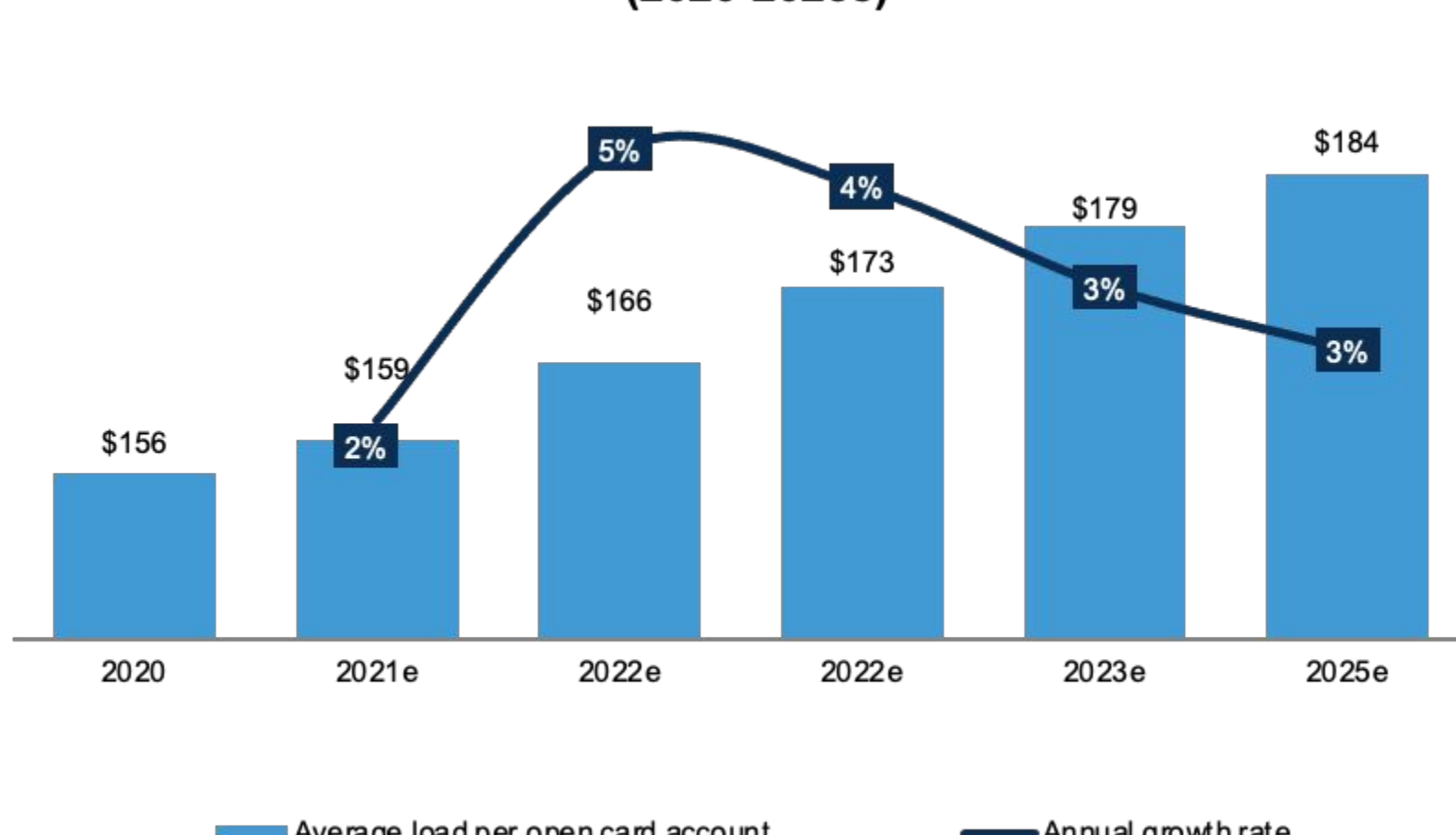
Average CA$ Loaded per Canadian Open Loop Prepaid Card Account (2020-2025e)

Aite-Novarica Group projects that the average annual load per Canadian open loop prepaid card account will grow steadily from $156 per card account in 2020 to $184 by 2025.